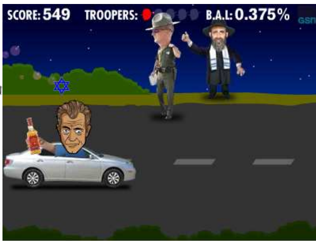
Figure 1: The political cartoon (left) and computer game (right) describing Mel Gibson's run in with the law do little more than summarize the the news event in a humorous way [16].

cartoon that contains the characteristics of a good Political Cartoon [24]. By trivializing the specific current event, the author uses the story as a tool to make a statement of lasting significance about the media's obsession with celebrity culture. The cartoon does more than merely summarize the event with caricatures as seen in figure 1.