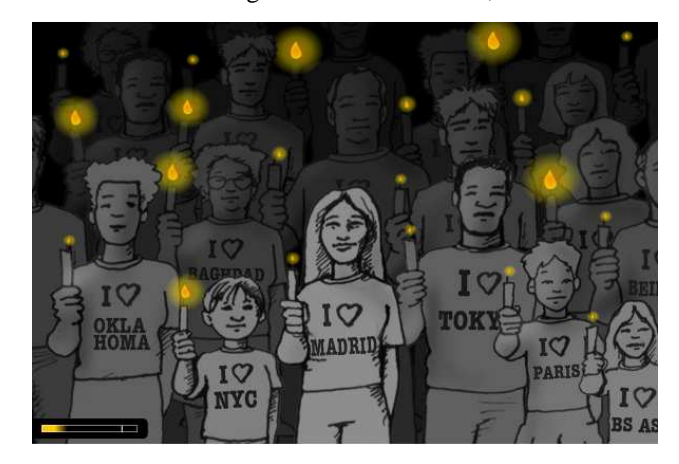
Figure 5: Madrid demonstrates how procedural rhetoric can send conflicting messages.

The message of Madrid becomes confused when a more literal reading is performed. Because the candles must be lit (clicked on) very quickly in order to raise the brightness meter, Madrid induces a frantic and busy state in the player. It takes much effort and grueling commitment to achieve the win state of the game. Because of this, Madrid has been