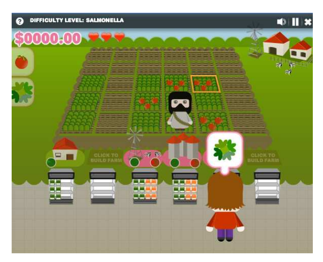
Figure 4: Bacteria Salad makes a sophisticated procedural argument against large scale agribusiness.

In summary, below is a list of criteria that describe an ideal newsgame as follows from the comparison of newsgames to political cartoons: